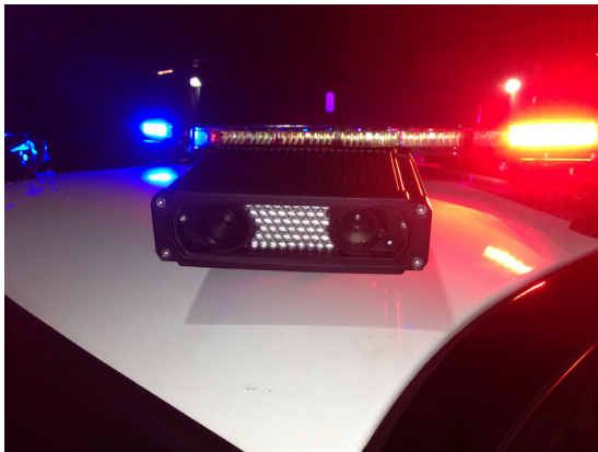
Two SRPD vehicles are outfitted with automatic license plate reader (ALPR) cameras.

The ALPR system alerts officers to vehicles that are stolen, displaying stolen license plates, and even those involved in an AMBER alert. The ALPR system is a computer-based system that utilizes special cameras to capture a color image, as well as an infrared image of a license plate from a passing vehicle. The images are converted to a text file utilizing Optical Character Recognition (OCR) technology. The text file is automatically compared against an “information data file” that contains information on stolen vehicles.