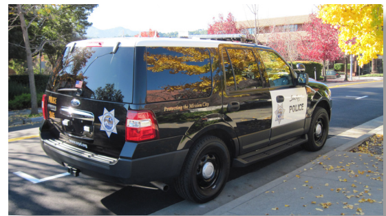
New supervisor’s vehicle provides additional resources to our officers in the field.

The vehicle is a 2011 Ford Expedition SUV and is outfitted with a compartment in the cargo area that allows supervisors to more quickly and effectively establish a command post for response to significant incidents. Our supervisor’s unit has already been put into action this last month and has been invaluable in coordinating our response to these incidents.